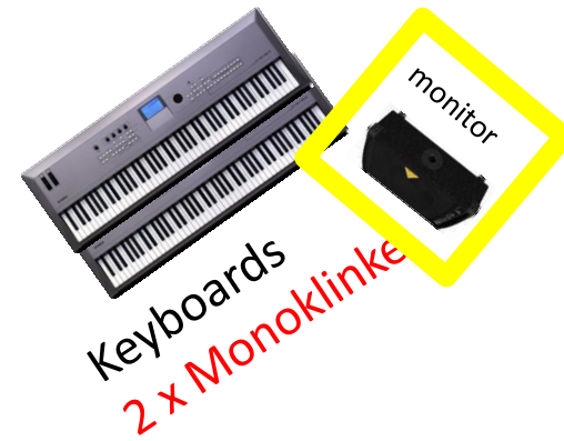
Keyboards 2 x Monoklinke